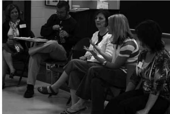
The popular "A Day in the Life" session gives parents a glimpse of the support mechanisms available to their children at the high school.

Adolescence can put a strain on the communications channels between teens and parents. This session will help you find ways to be part of your child's life in productive ways. You'll learn how to ask questions without interrogating, how to be supportive but not controlling, and how to be an effective cheerleader for your child.